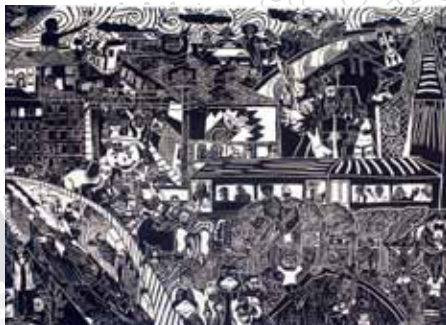
The African American Experience by Angel Perez