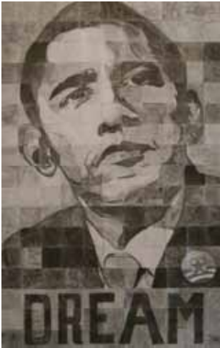
Dream by 6th Grade Advanced