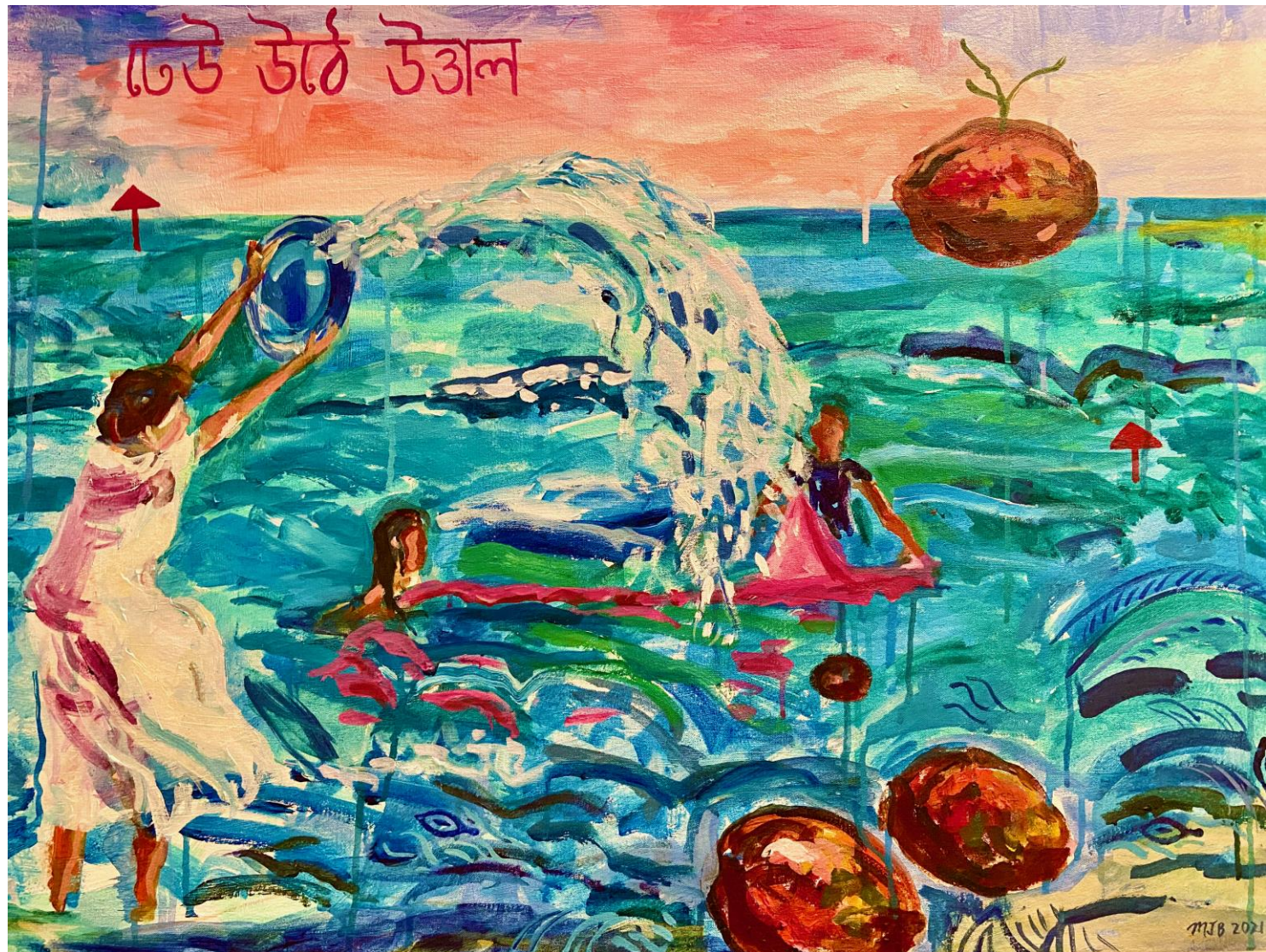
"When the Storm Waves Hit the Sky" Acrylic on canvas, 36 x 51 inches, 2022