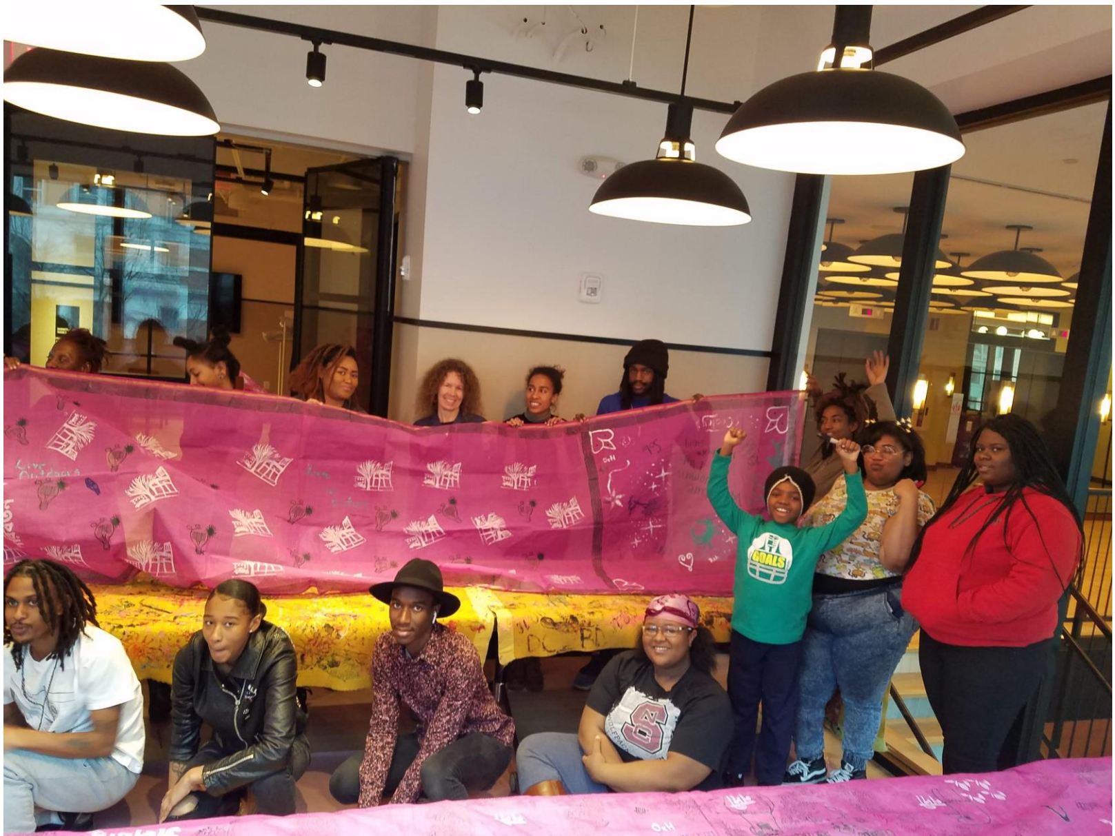
Sari climate pledge workshop, Eaton Hotel March 2019