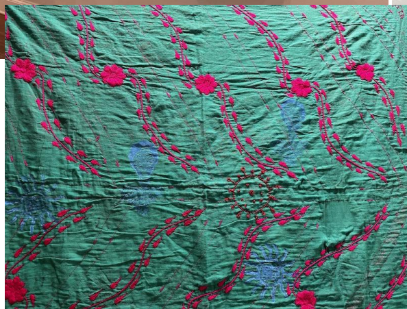
Nourish Exhibition - Poetry, Saris, Video (2023) The Nicholson Project, Washington DC