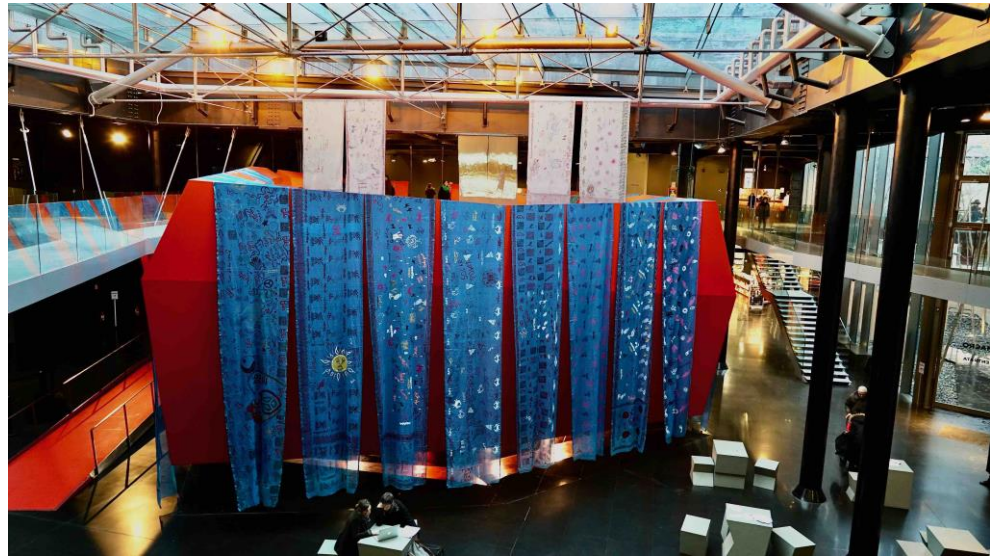
Deux Degrés (Paris, France 2017), Footprint (Athens, Greece 2018), Global Climate Action Summit (San Francisco, 2018), MACRO Museum (Rome, 2019)