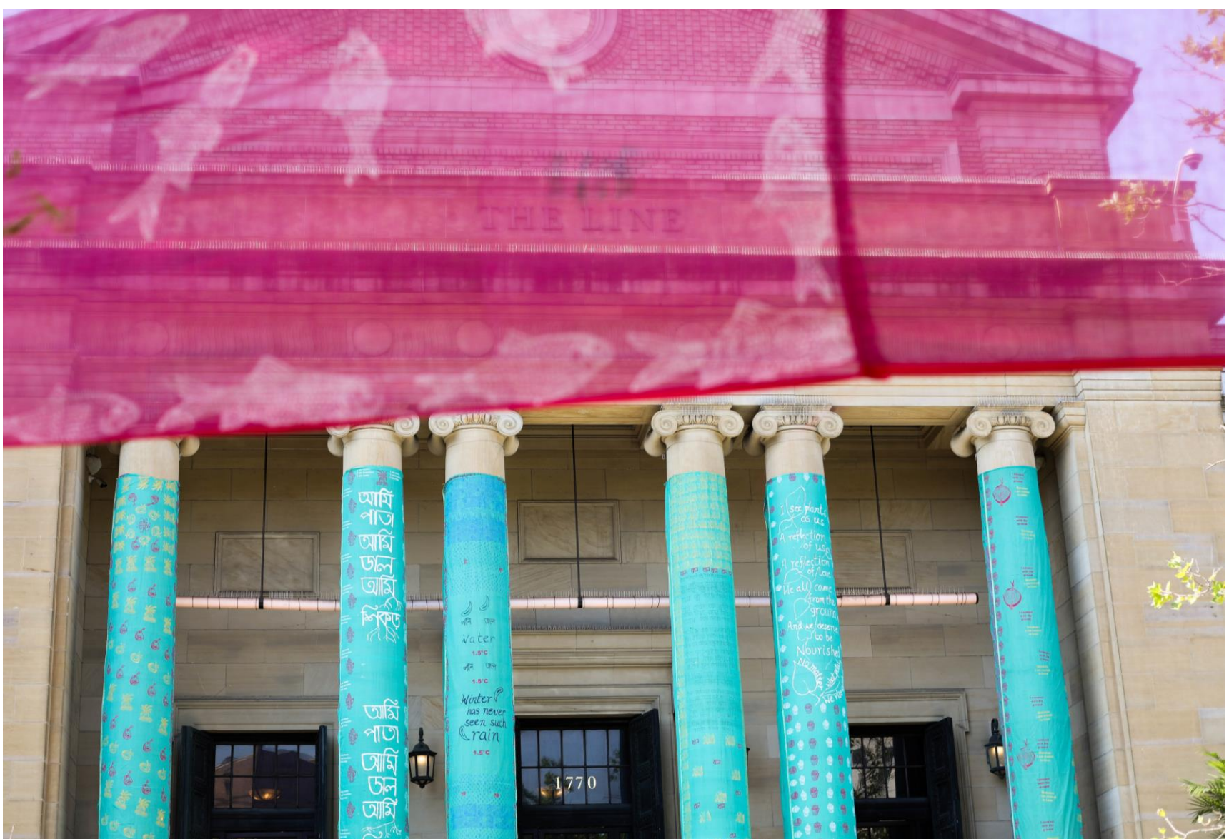
SUSTAIN Public Art Project, The Line DC and Unity Park, June 2022 Monica Jahan Bose saris covered with climate and food justice songs and poems and imagery - 7 sound walk stations