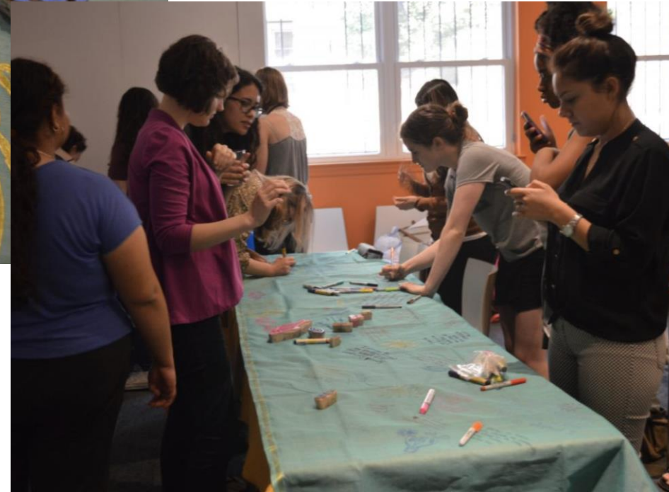
Sari climate pledge workshops begin in 2015 Sierra Club Youth Gender & Climate Workshop, Washington DC