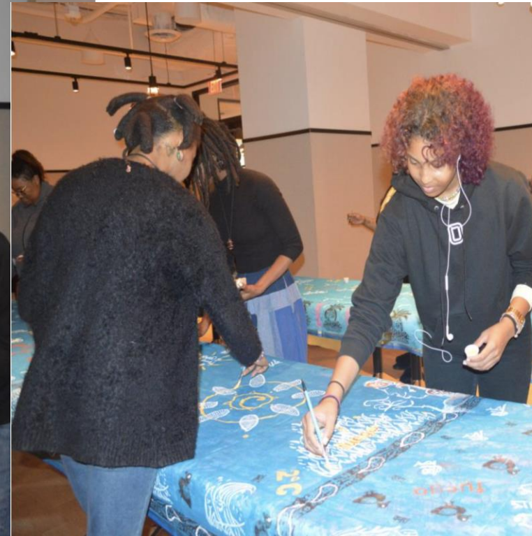
Final In Person Workshop before Lockdown March 11, 2020