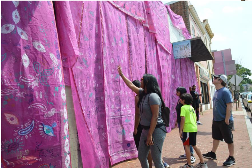
WRAPture Public Art Project & Film, Anacostia 2019 65 saris covered with climate imagery