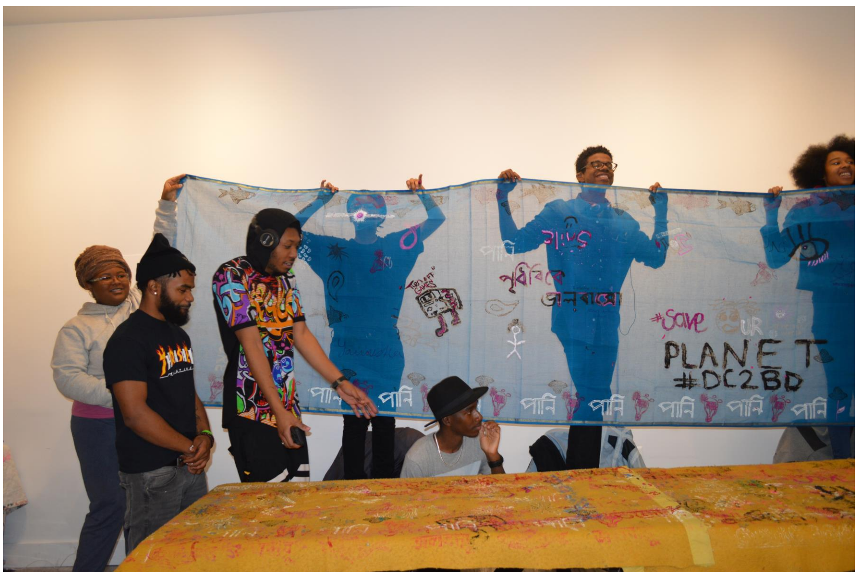
Sari climate pledge workshop, Project Create Washington DC, January 2019