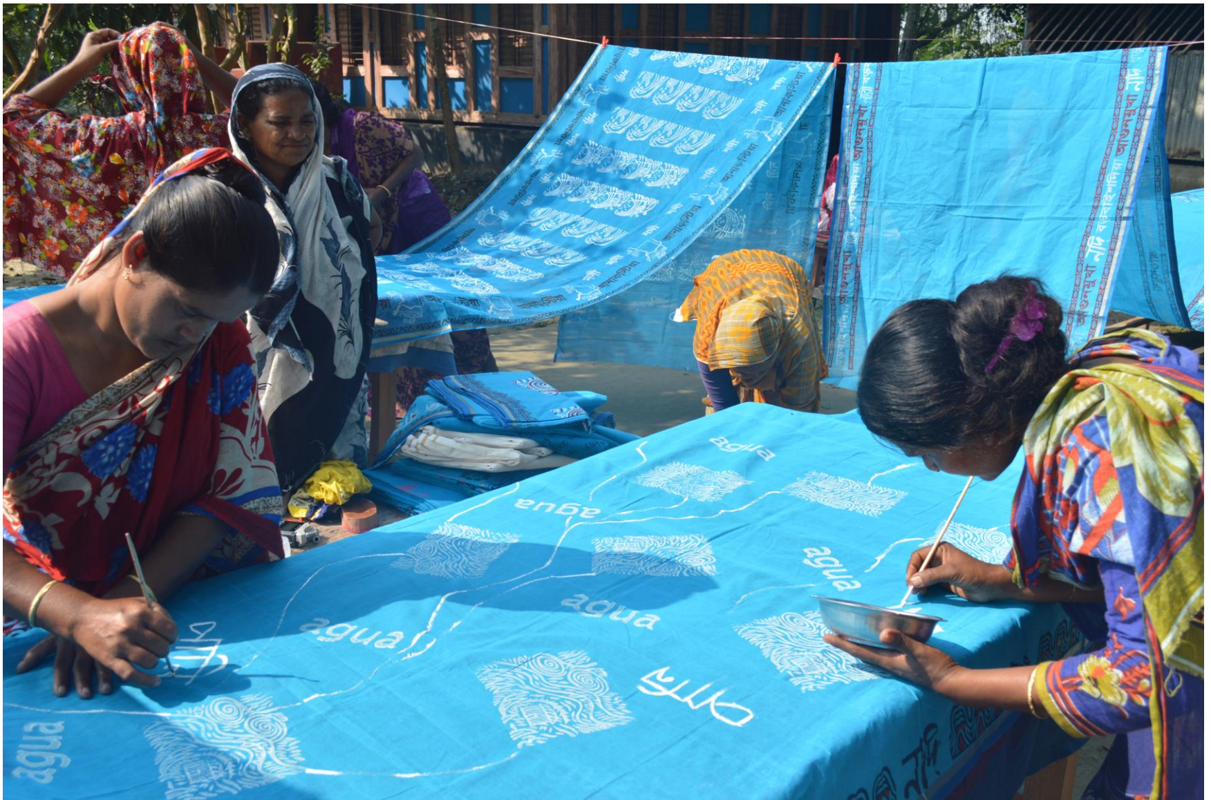
Making climate saris Katakali, February 2020