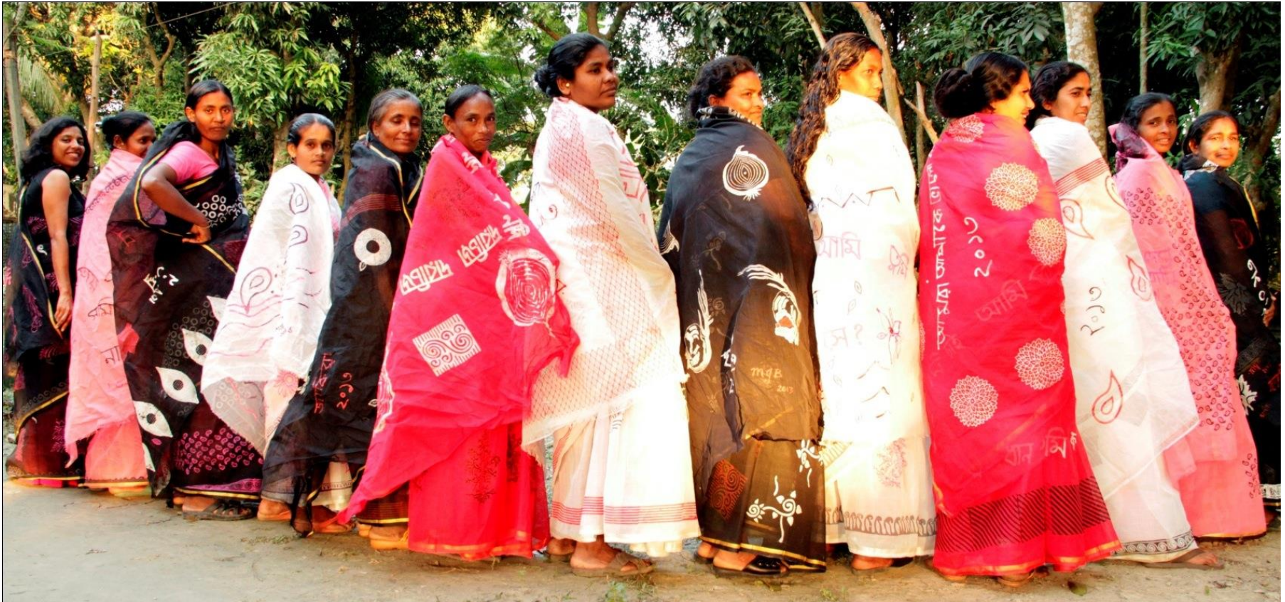
First set of collaborative saris, 2013, Katakali Village, Bangladesh