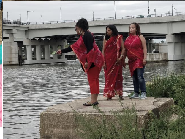
Change Is Coming Performance and Workshops, Anacostia 2017