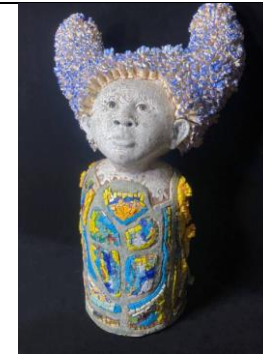
Chris Malone, Creative Lockdown, 2021 mixed media mosaic, 23 x 14 x 8 in. LOCATION Office of Gun Violence Prevention 1350 Penn Avenue NW, Suite 533

The Art Bank Program supports local visual artists, District art galleries, and art nonprofit organizations, in which CAH acquires fine art. The ongoing and annual acquisition of art from metropolitan artists becomes a part of the Art Bank Collection. It is then loaned to District Government agencies for display in public areas and offices of government buildings. The Art Bank Collection, which started in 1986, has nearly 3,000 artworks.